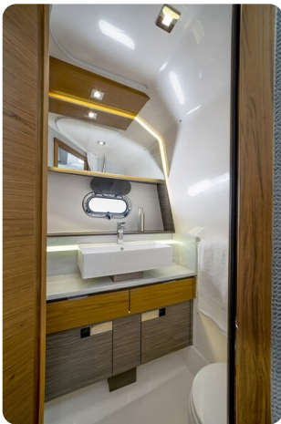
Tiara 43 LS bathroom