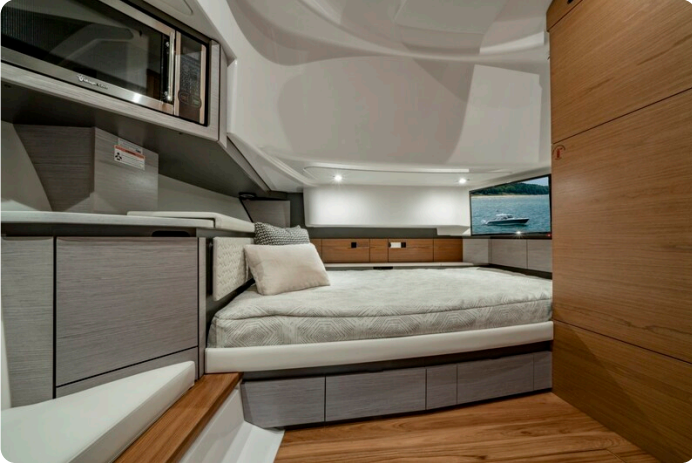
Tiara 43LS cabin