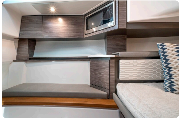
Tiara 43 LS interior detail