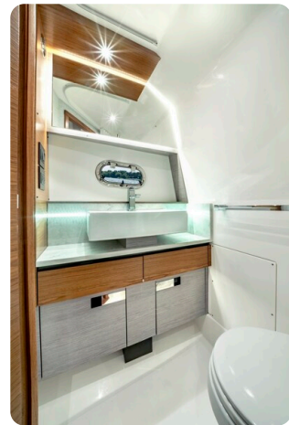
Tiara 43LS head