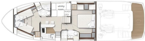
PRED50 lower deck w. utility room