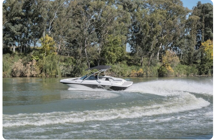
Sensation SXI 230 45