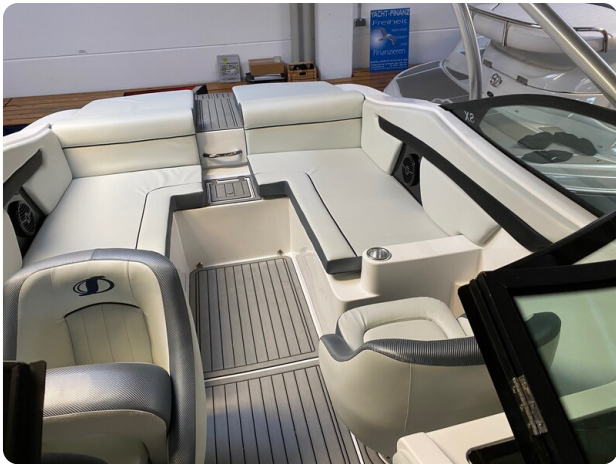
Sensation SXI 230 14