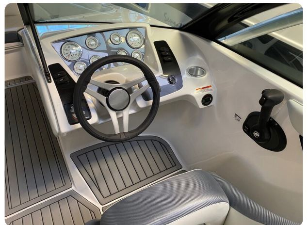
Sensation SXI 230 6