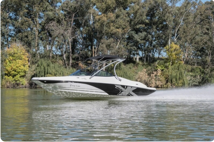
Sensation SXI 230 44