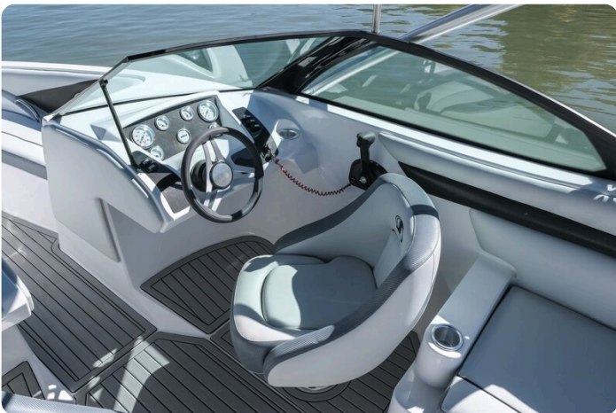
Sensation SXI 230 46