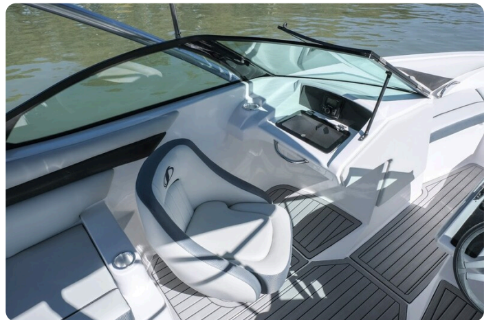
Sensation SXI 230 47