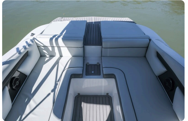
Sensation SXI 230 1