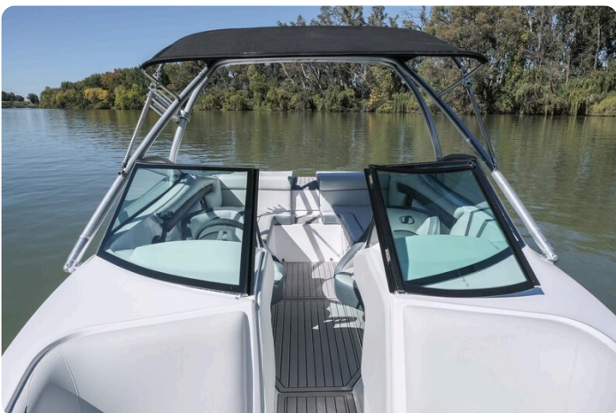
Sensation SXI 230 48