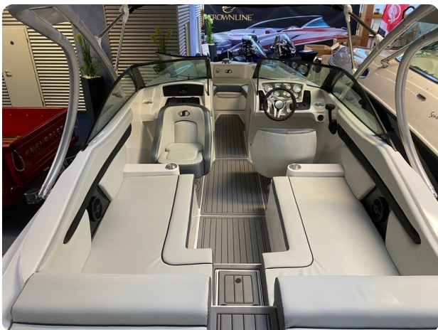
Sensation SXI 230 5