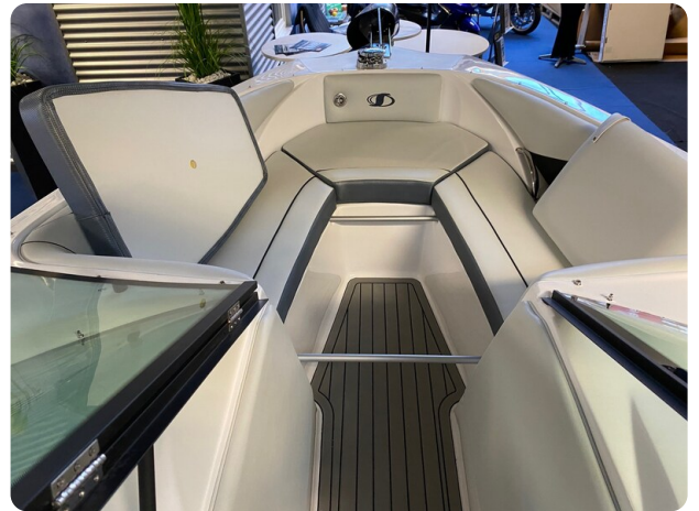
Sensation SXI 230 8