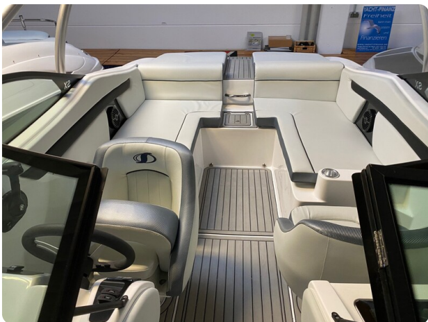
Sensation SXI 230 11