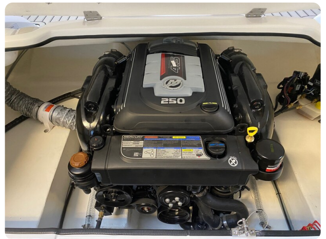
Sensation SXI 230 16