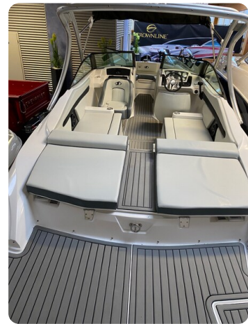
Sensation SXI 230 2