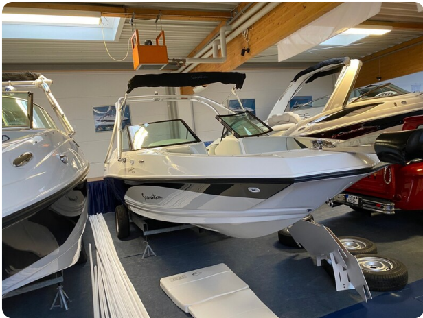
Sensation SXI 230 19