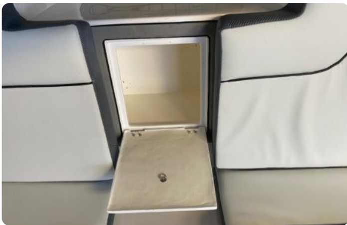
Sensation SXI 230 32