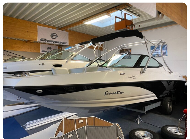
Sensation SXI 230 21