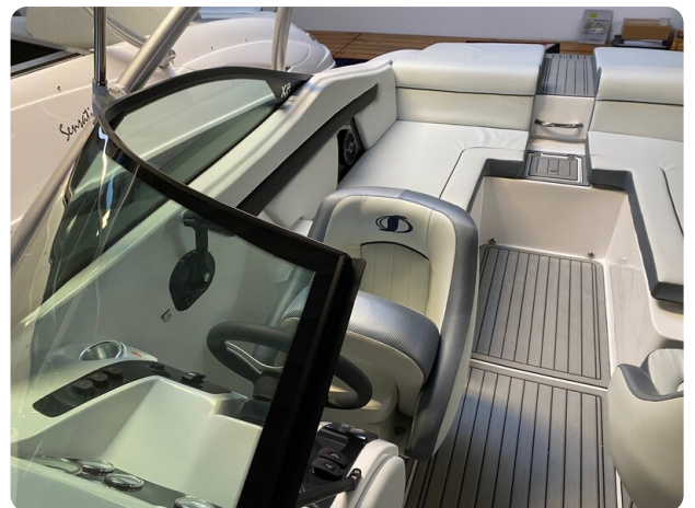
Sensation SXI 230 13