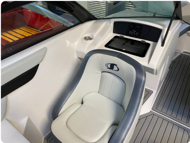
Sensation SXI 230 7