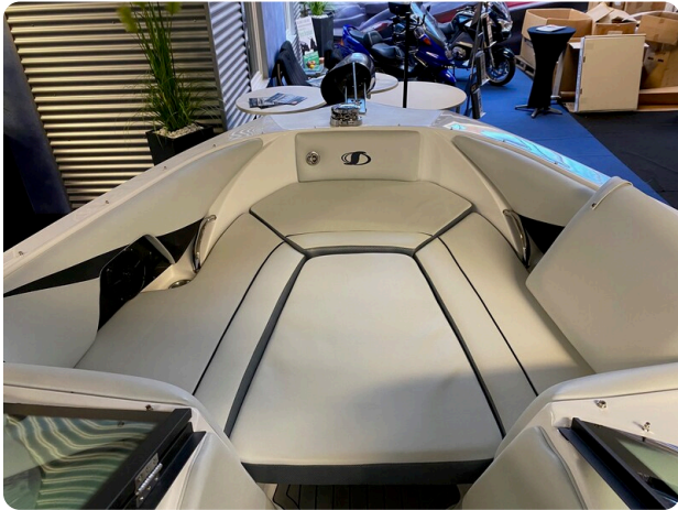
Sensation SXI 230 9