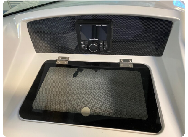
Sensation SXI 230 18