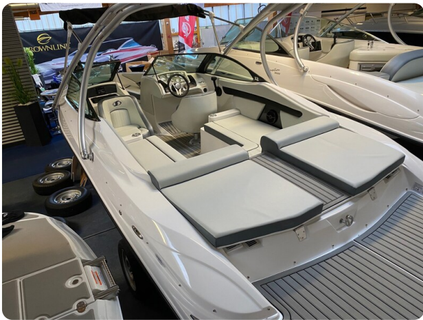
Sensation SXI 230 4