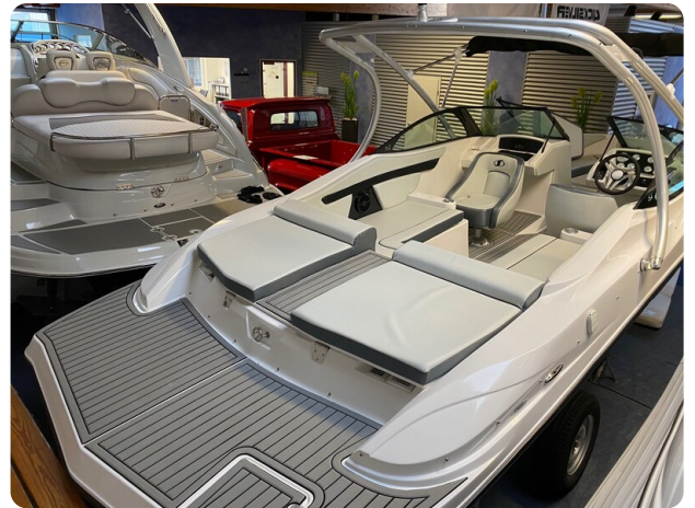
Sensation SXI 230 3