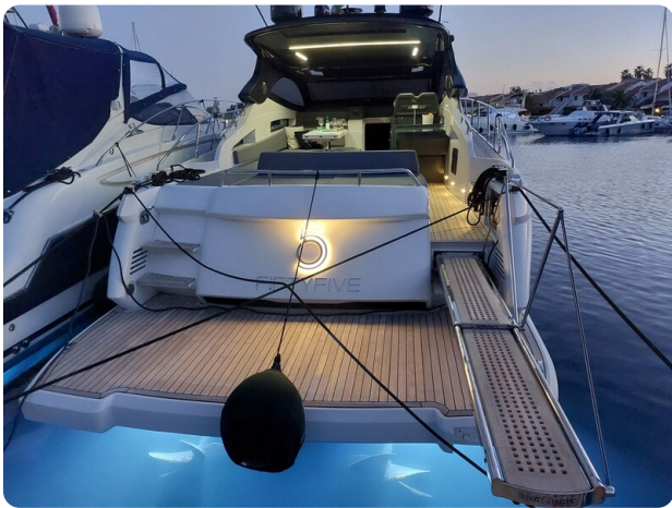
Rizzardi IN five Fiftyfive.jpg