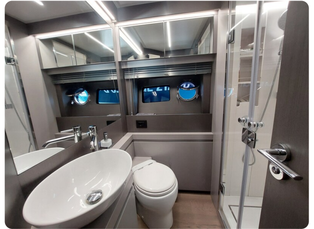
Rizzardi IN five Fiftyfive.jpg