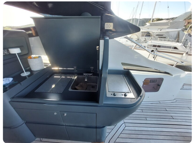
Rizzardi IN five Fiftyfive.jpg