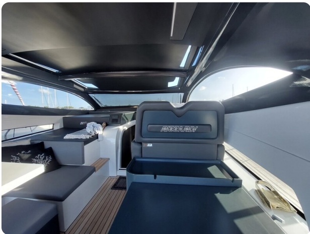
Rizzardi IN five Fiftyfive.jpg