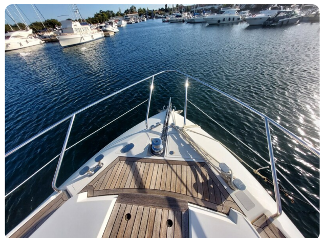
Rizzardi IN five Fiftyfive.jpg