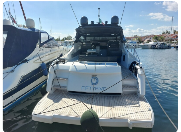
Rizzardi IN five Fiftyfive.jpg