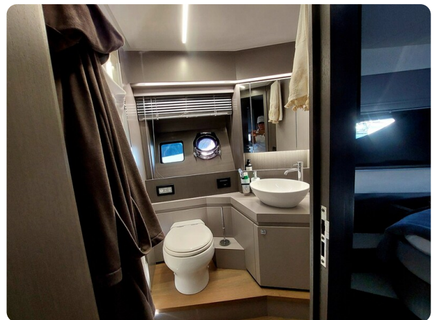
Rizzardi IN five Fiftyfive.jpg