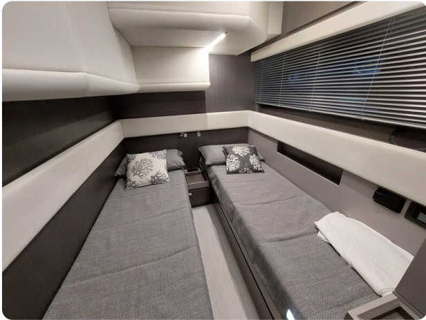
Rizzardi IN five Fiftyfive.jpg