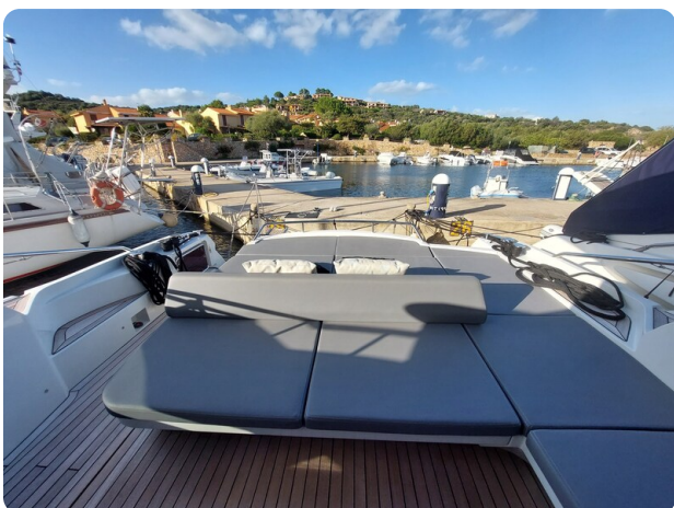
Rizzardi IN five Fiftyfive.jpg