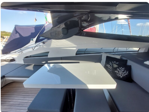
Rizzardi IN five Fiftyfive.jpg