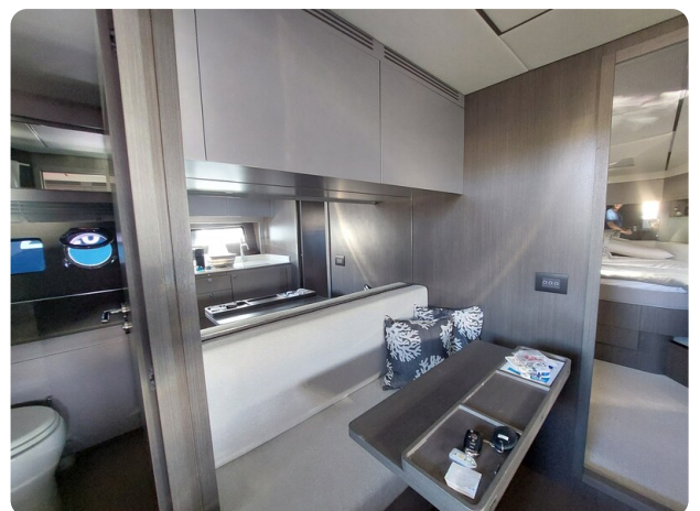
Rizzardi IN five Fiftyfive.jpg