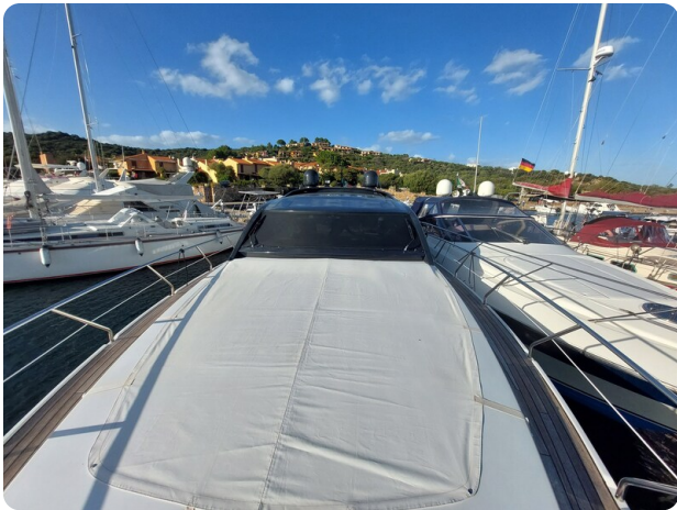
Rizzardi IN five Fiftyfive.jpg