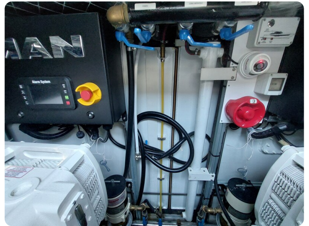
Rizzardi IN five Fiftyfive.jpg