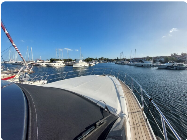
Rizzardi IN five Fiftyfive.jpg