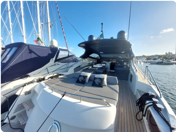
2Rizzardi IN five Fiftyfive.jpg