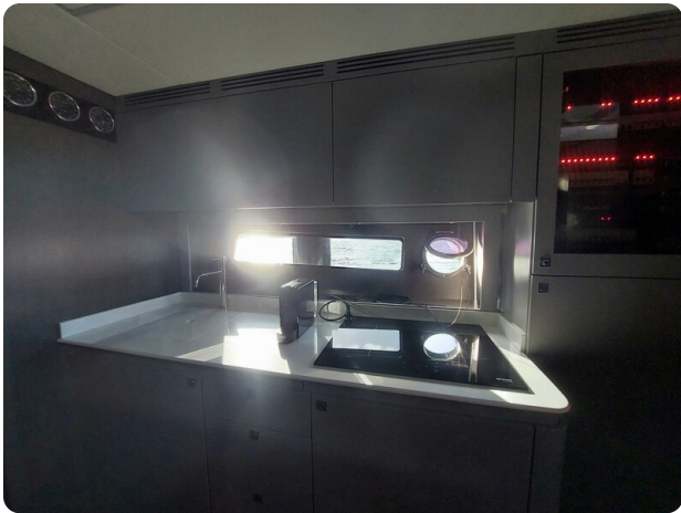
Rizzardi IN five Fiftyfive.jpg