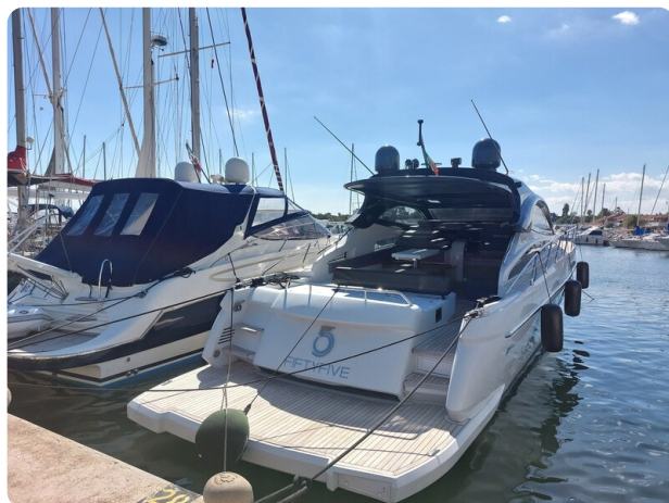
Rizzardi IN five Fiftyfive.jpg