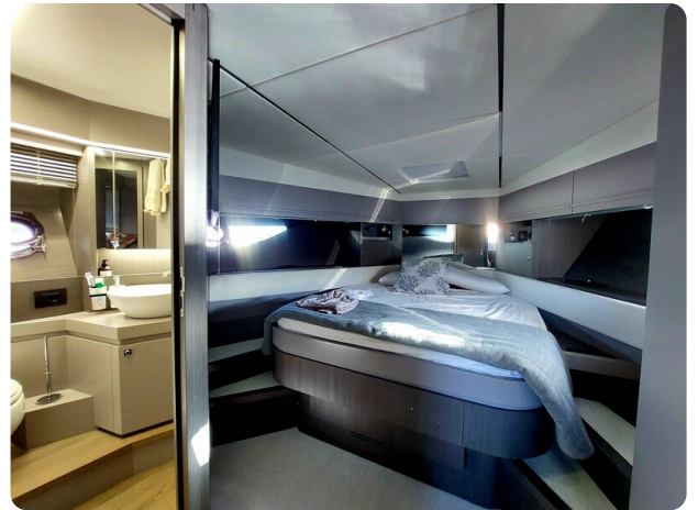
Rizzardi IN five Fiftyfive.jpg