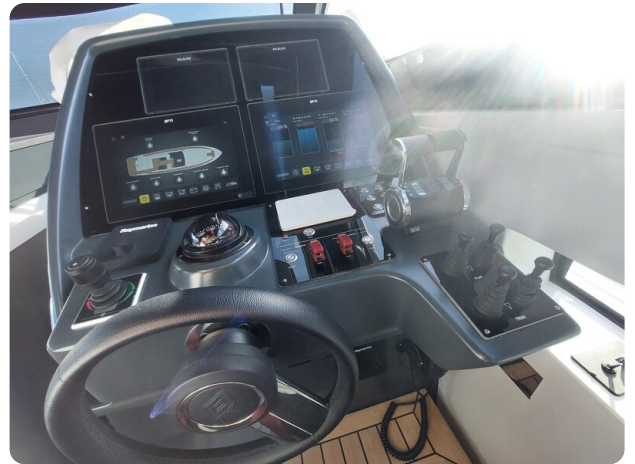
Rizzardi IN five Fiftyfive.jpg