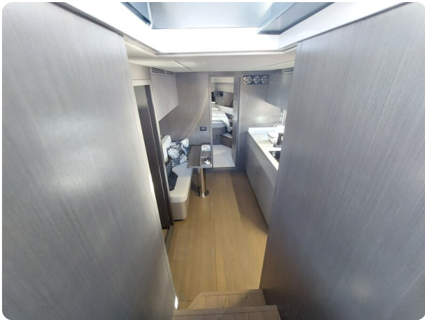
Rizzardi IN five Fiftyfive.jpg