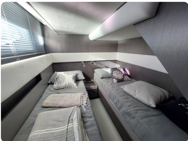
Rizzardi IN five Fiftyfive.jpg