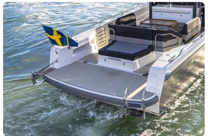
Nimbus Tender 11 (T11) Exterior 14