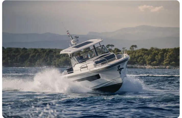
Nimbus Tender 11 (T11) Exterior 12