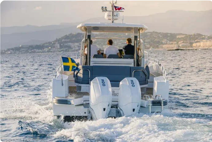
Nimbus Tender 11 (T11) Exterior 13