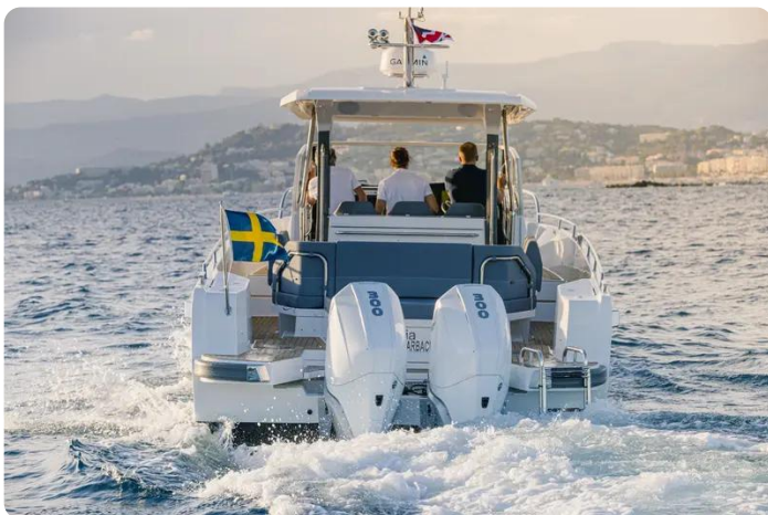
Nimbus Tender 11 (T11) Exterior 13