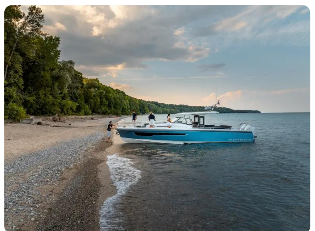
Nimbus Tender 11 (T11) Exterior 8