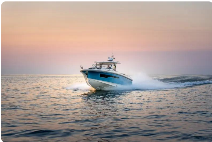
Nimbus Tender 11 (T11) Exterior 11