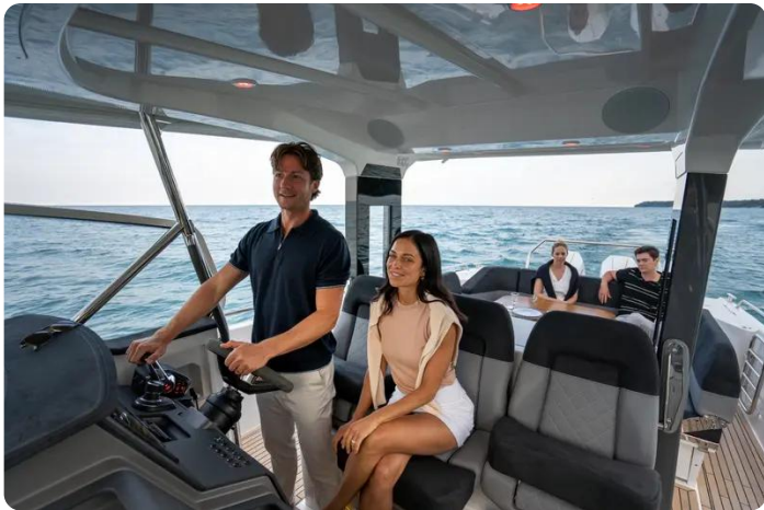
Nimbus Tender 11 (T11) Cabin 1