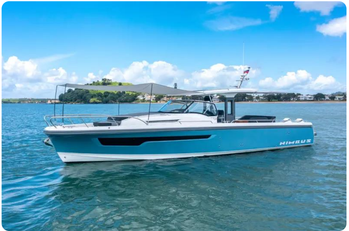
Nimbus Tender 11 (T11) Exterior 7