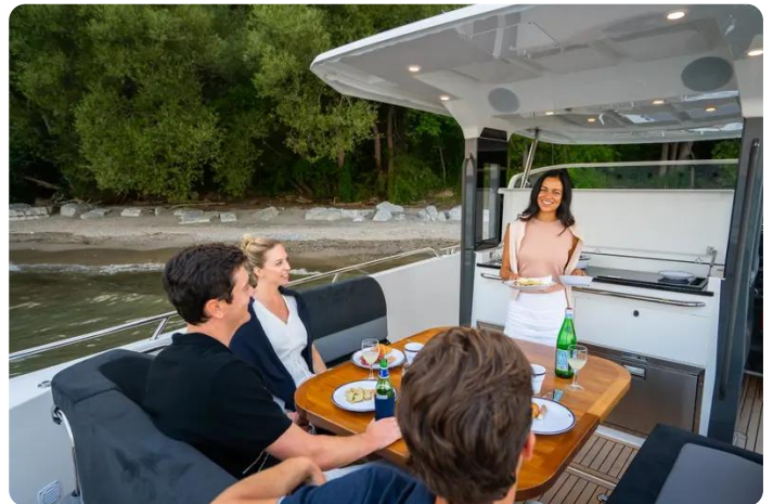
Nimbus Tender 11 (T11) Deck 7