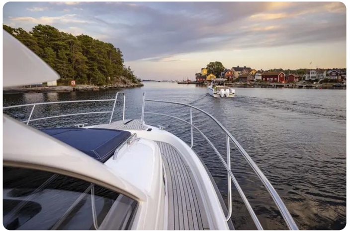
Nimbus Tender 11 (T11) Deck 10