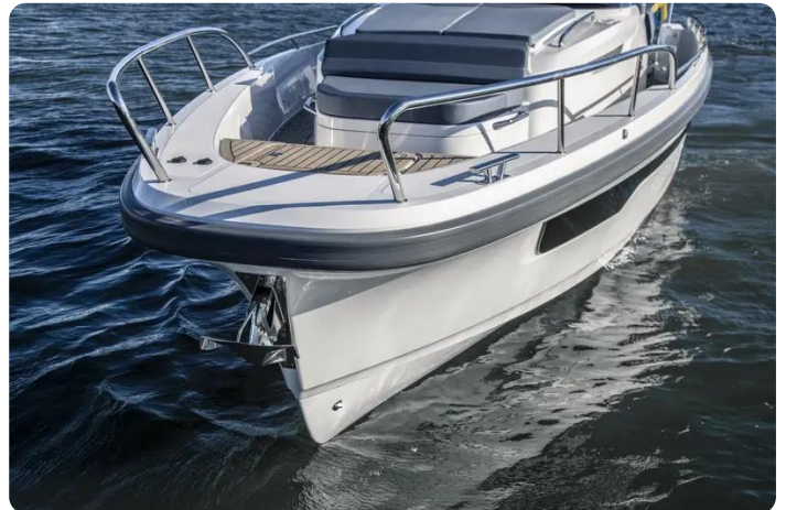
Nimbus Tender 11 (T11) Exterior 4