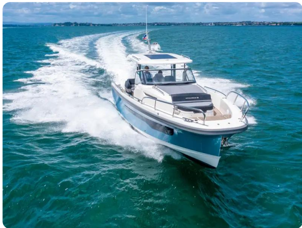
Nimbus Tender 11 (T11) Exterior 6