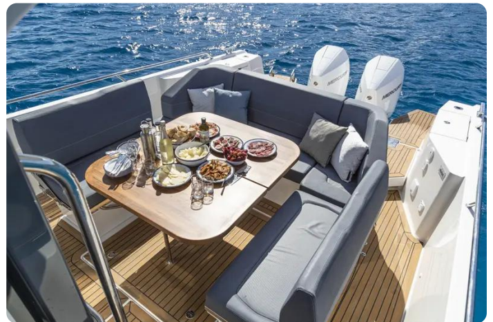
Nimbus Tender 11 (T11) Deck 5