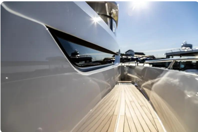
Nimbus Tender 11 (T11) Deck 3