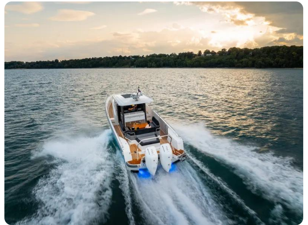
Nimbus Tender 11 (T11) Exterior 10