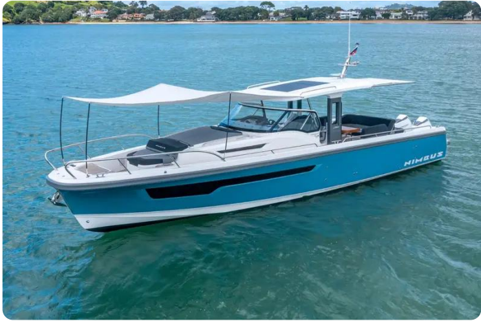
Nimbus Tender 11 Featured