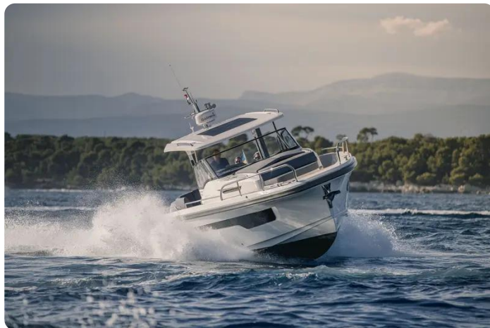
Nimbus Tender 11 (T11) Exterior 12