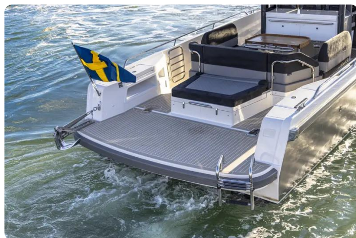
Nimbus Tender 11 (T11) Exterior 14