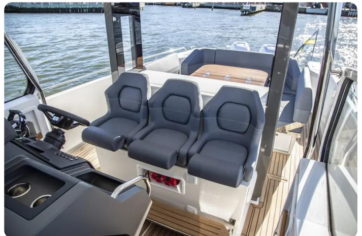
Nimbus Tender 11 (T11) Deck 1