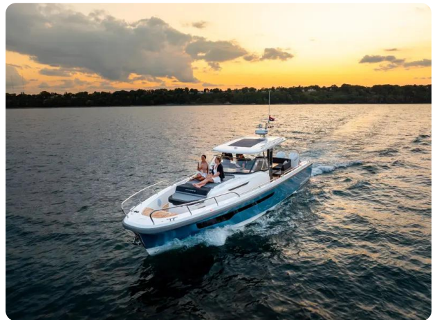
Nimbus Tender 11 (T11) Exterior 1