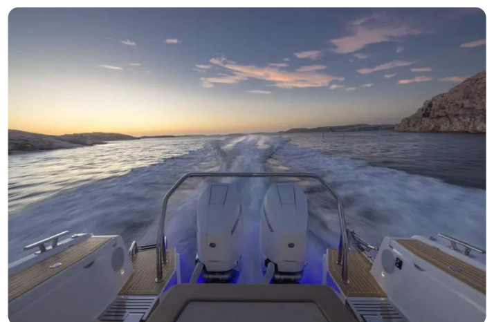
Nimbus Tender 11 (T11) Outboard