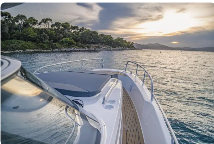
Nimbus Tender 11 (T11) Deck 2