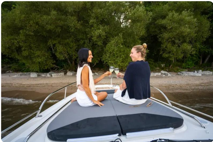
Nimbus Tender 11 (T11) Deck 8