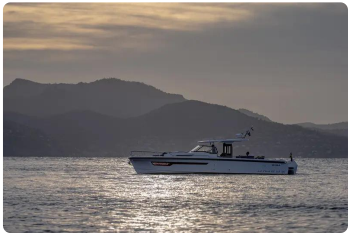
Nimbus Tender 11 (T11) Exterior