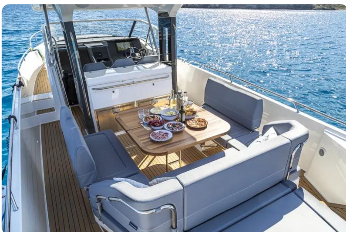
Nimbus Tender 11 (T11) Deck 4