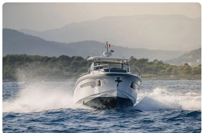
Nimbus Tender 11 (T11) Exterior 2