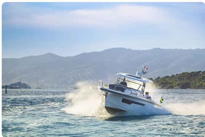
Nimbus Tender 11 (T11) Exterior 3