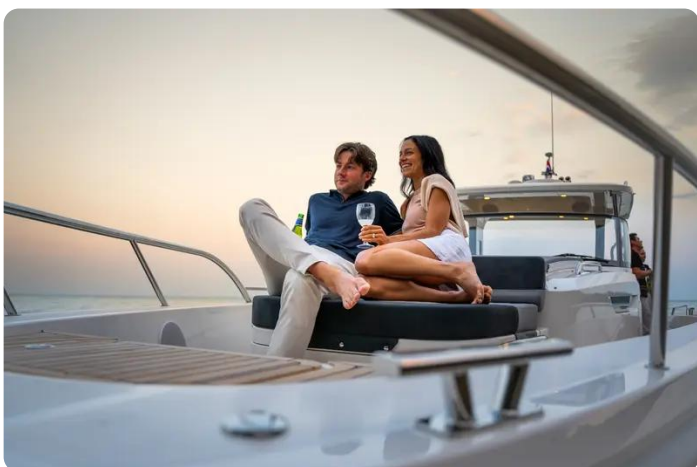
Nimbus Tender 11 (T11) Deck 6