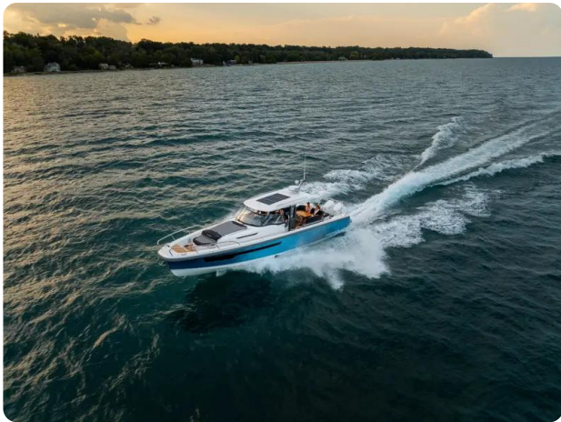
Nimbus Tender 11 (T11) Exterior 9