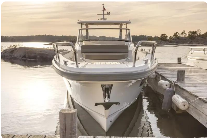
Nimbus Tender 11 (T11) Exterior 5