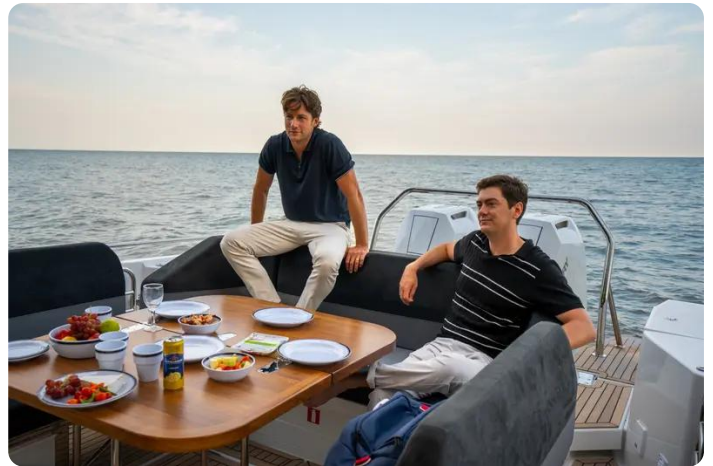
Nimbus Tender 11 (T11) Deck 9