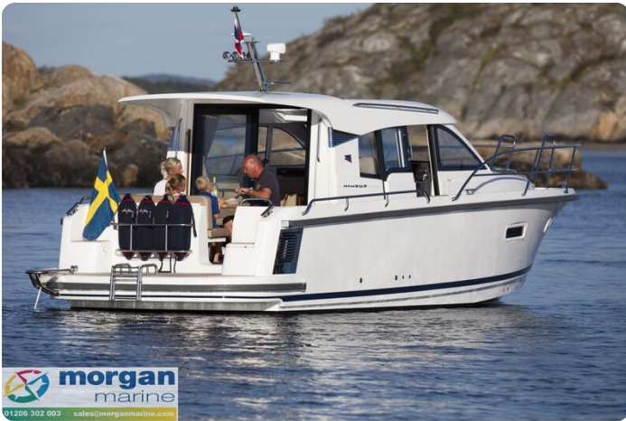
Nimbus 305 Coupe Exterior 12