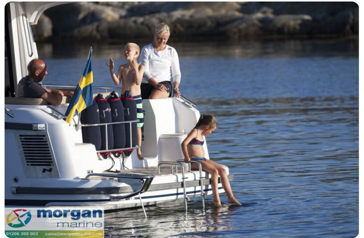
Nimbus 305 Coupe Exterior 13