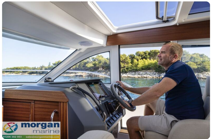
Nimbus 305 Coupe Interior 2