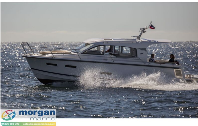
Nimbus 305 Coupe Exterior 15