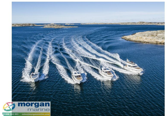
Nimbus 305 Coupe Exterior 22