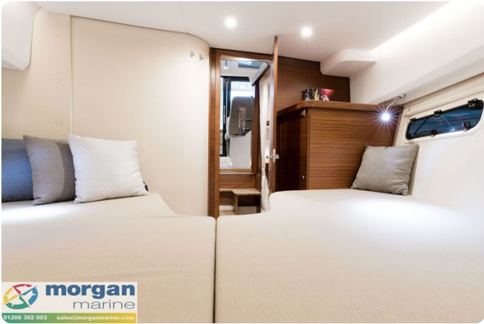
Nimbus 305 Coupe Cabin 2