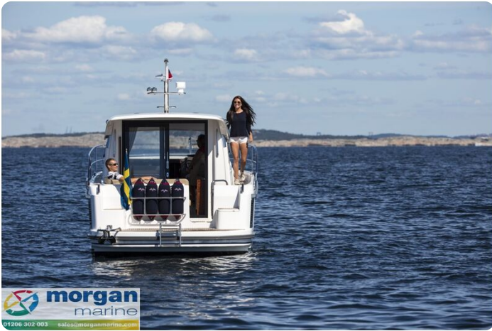
Nimbus 305 Coupe Exterior 14