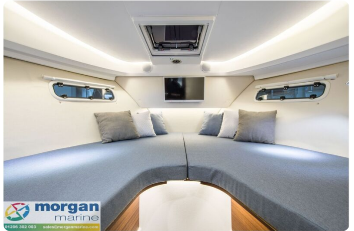
Nimbus 305 Coupe Cabin 1