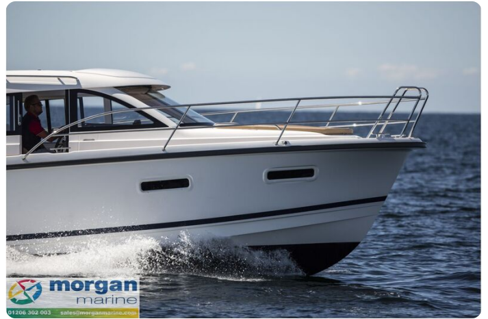
Nimbus 305 Coupe Exterior 3