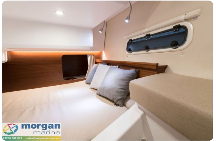
Nimbus 305 Coupe Cabin 4