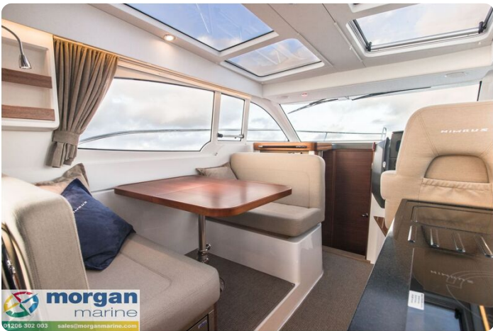
Nimbus 305 Coupe Interior 1