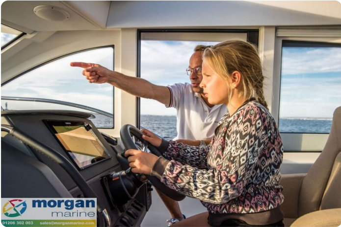
Nimbus 305 Coupe Interior 3