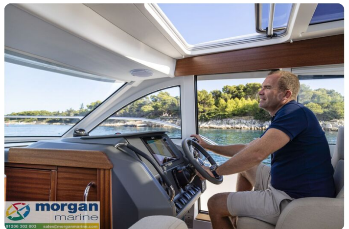
Nimbus 305 Coupe Interior 2