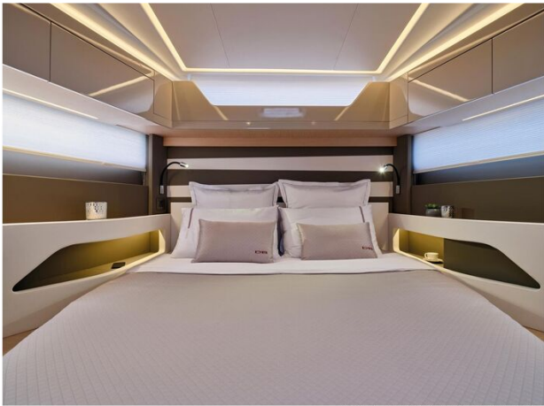
Jasmeau DB 43 - Attention obligatoire / Mandatory credits Photo Nicolas Claris