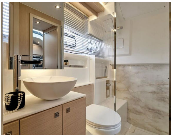
Jeanneau DB 43 - Mention obligatoire / Mandatory credits: Photo Nicolas Claris