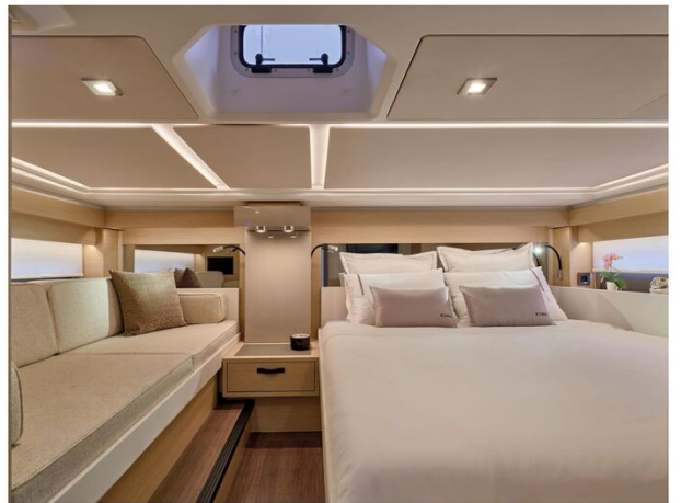
Jeanneau DB 43