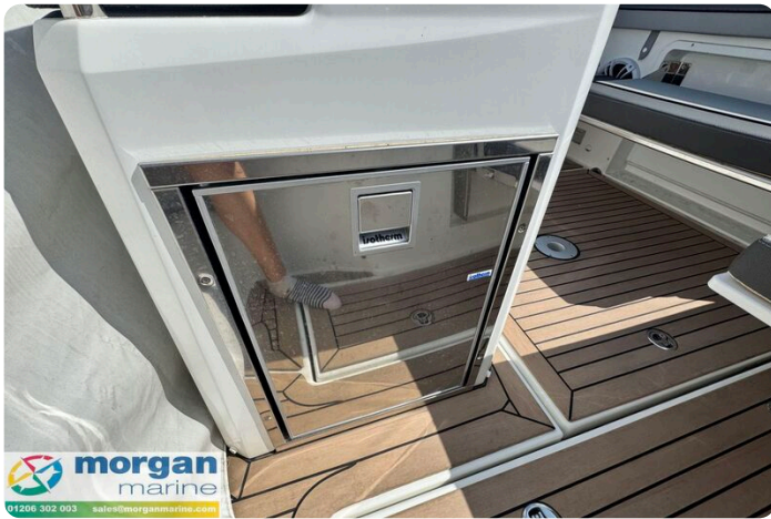
Jeanneau Cap Camarat 7.5 WA S3 - cockpit fridge