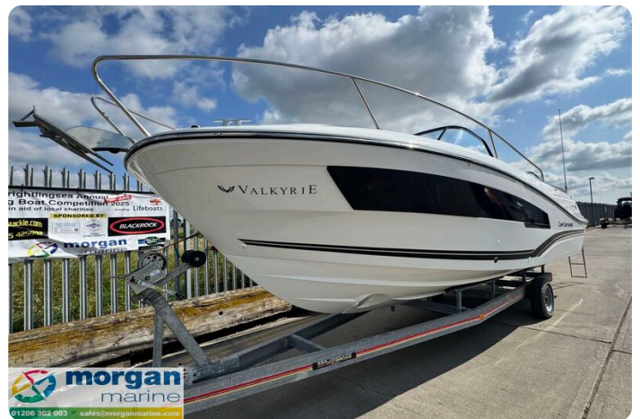
Jeanneau Cap Camarat 7.5 WA S3 - bow