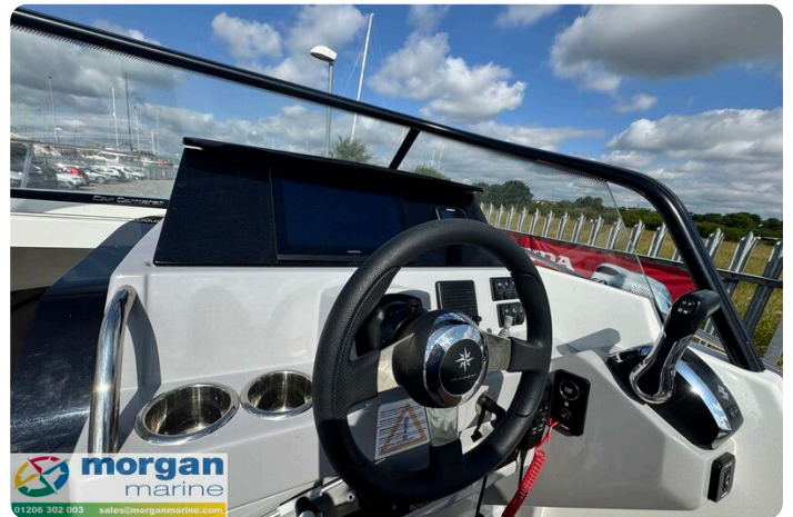
Jeanneau Cap Camarat 7.5 WA S3 - cup holder