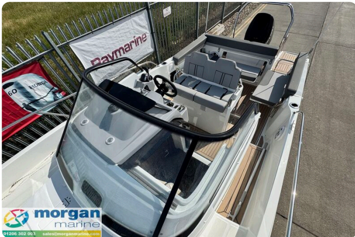
Jeanneau Cap Camarat 7.5 WA S3 - windscreen