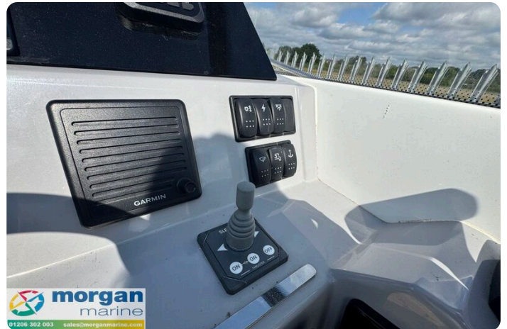
Jeanneau Cap Camarat 7.5 WA S3 - bow thruster