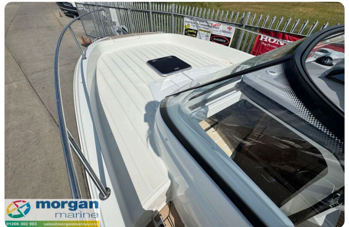
Jeanneau Cap Camarat 7.5 WA S3 - deck