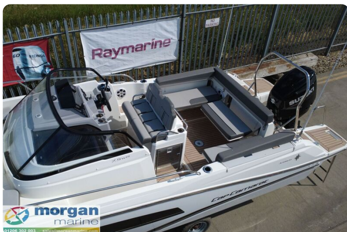
Jeanneau Cap Camarat 7.5 WA S3 - bolster seats