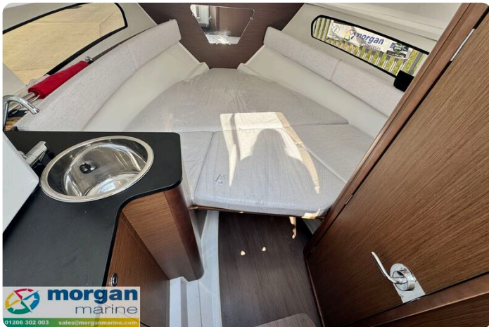
Jeanneau Cap Camarat 7.5 WA S3 - cabin