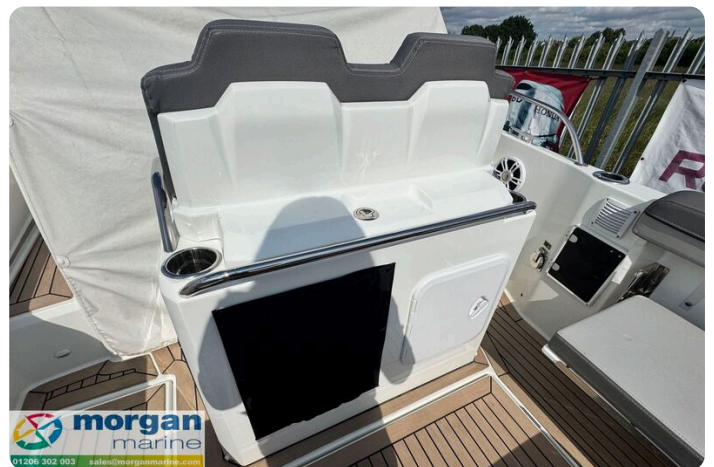
Jeanneau Cap Camarat 7.5 WA S3 - cockpit galley