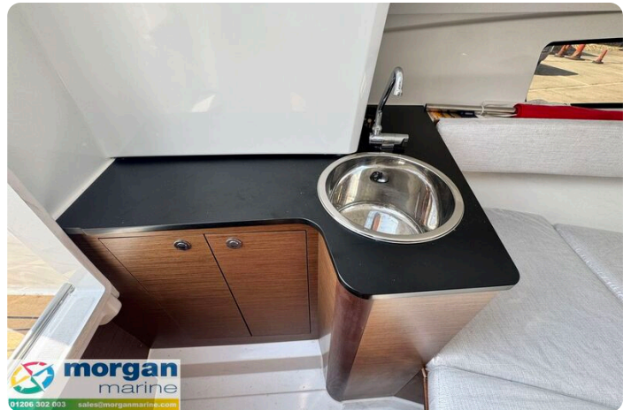
Jeanneau Cap Camarat 7.5 WA S3 - galley sink