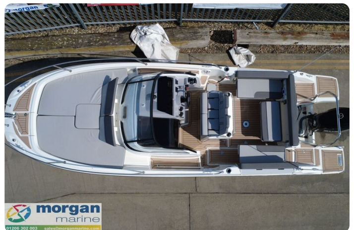
Jeanneau Cap Camarat 7.5 WA S3 - top view