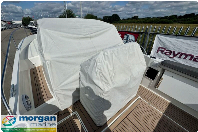
Jeanneau Cap Camarat 7.5 WA S3 - console cover