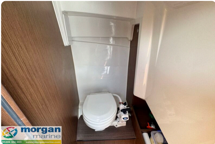
Jeanneau Cap Camarat 7.5 WA S3 - toilet