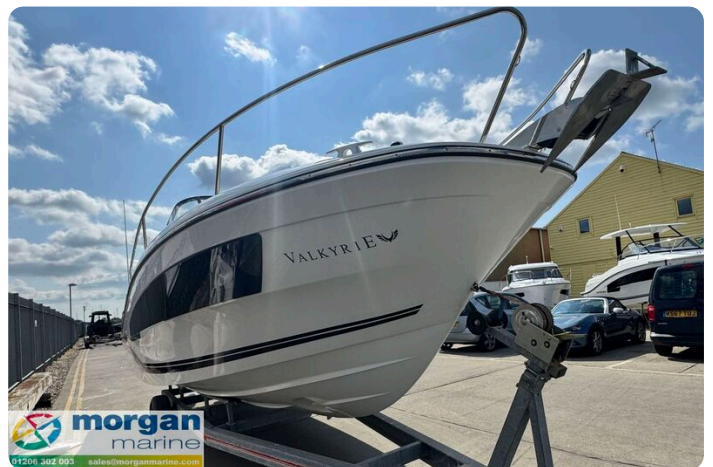
Jeanneau Cap Camarat 7.5 WA S3 - rails