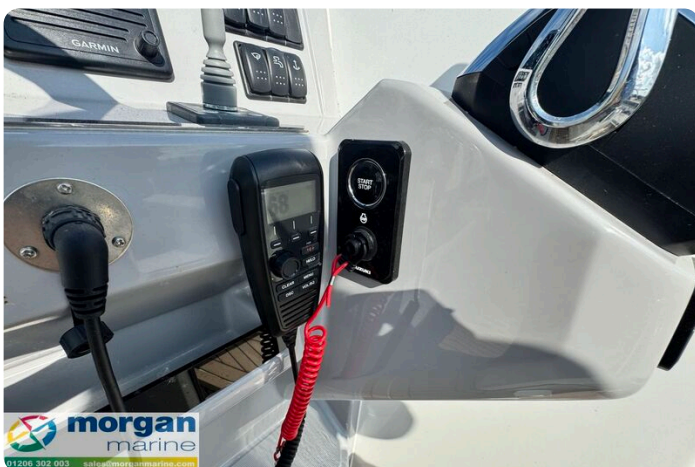
Jeanneau Cap Camarat 7.5 WA S3 - vhf radio