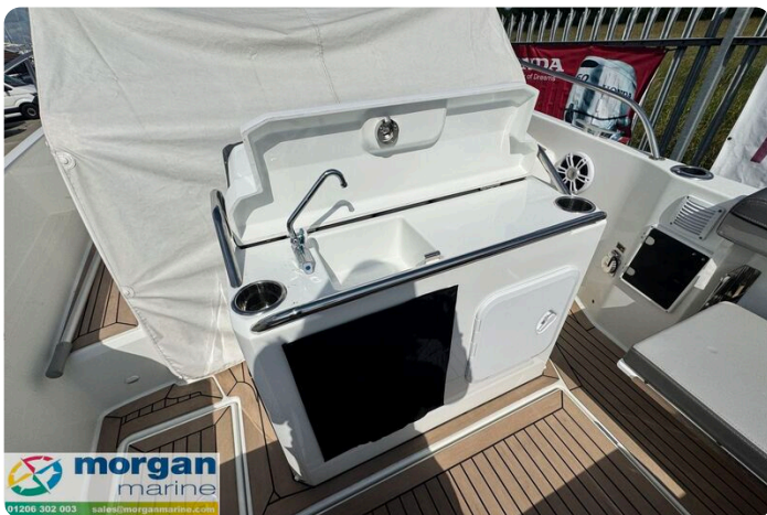
Jeanneau Cap Camarat 7.5 WA S3 - cockpit sink