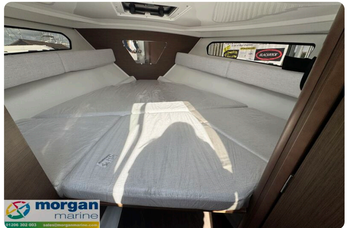
Jeanneau Cap Camarat 7.5 WA S3 - main berth