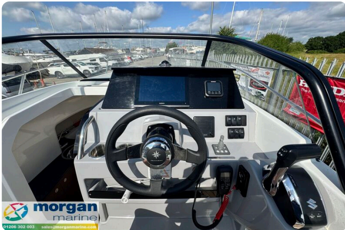
Jeanneau Cap Camarat 7.5 WA S3 - dash