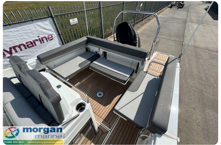
Jeanneau Cap Camarat 7.5 WA S3 - cockpit seating