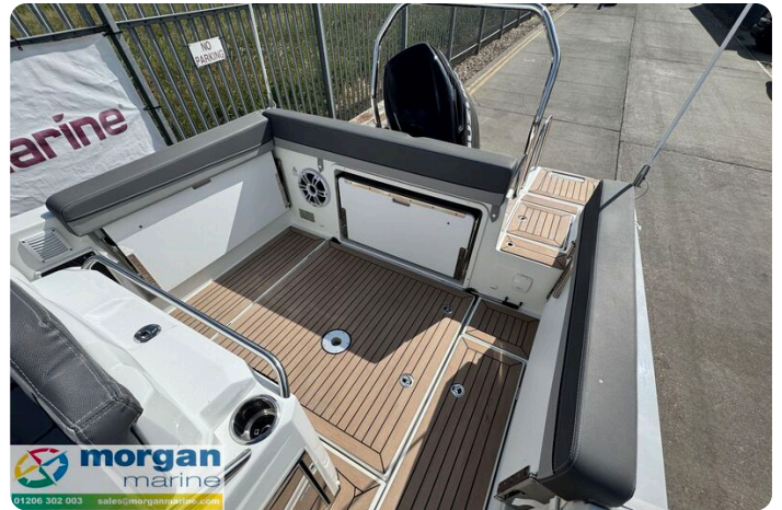
Jeanneau Cap Camarat 7.5 WA S3 - cockpit