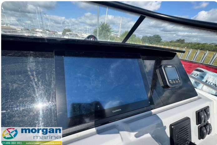
Jeanneau Cap Camarat 7.5 WA S3 - Garmin