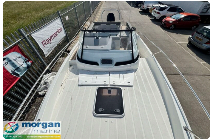
Jeanneau Cap Camarat 7.5 WA S3 - deck hatch