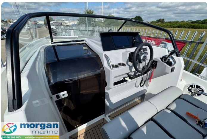
Jeanneau Cap Camarat 7.5 WA S3 - door