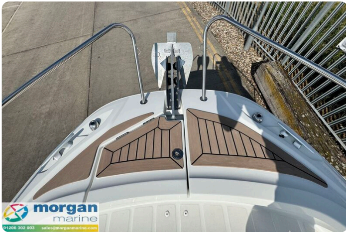
Jeanneau Cap Camarat 7.5 WA S3 - bow locker