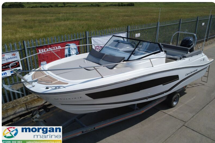
Jeanneau Cap Camarat 7.5 WA S3 - bow seating