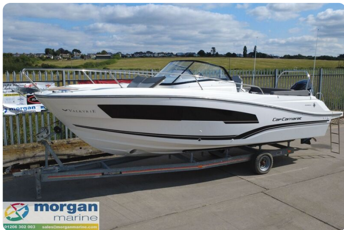
Jeanneau Cap Camarat 7.5 WA S3 - Main