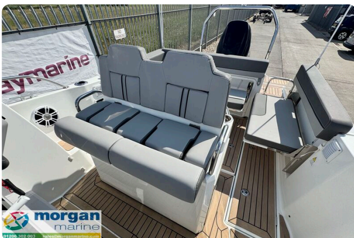
Jeanneau Cap Camarat 7.5 WA S3 - bolster seats