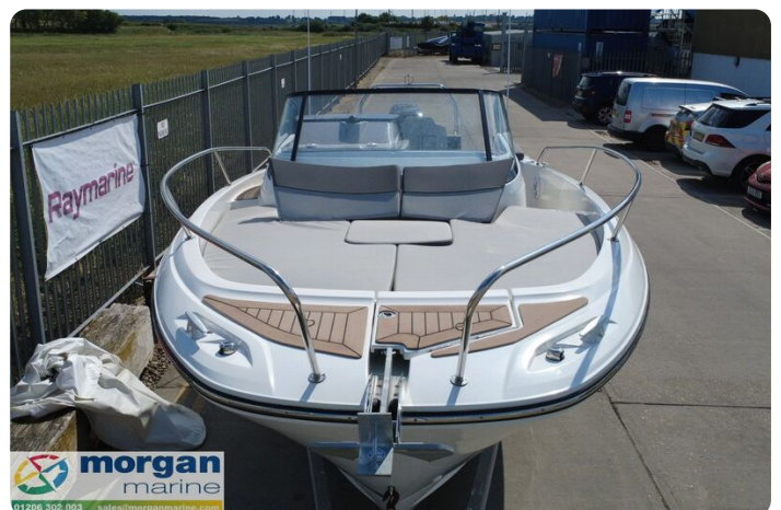
Jeanneau Cap Camarat 7.5 WA S3 - anchor