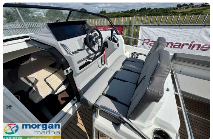
Jeanneau Cap Camarat 7.5 WA S3 - wheel