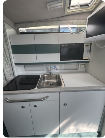
Formula BALU 66