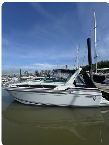
Formula BALU 74