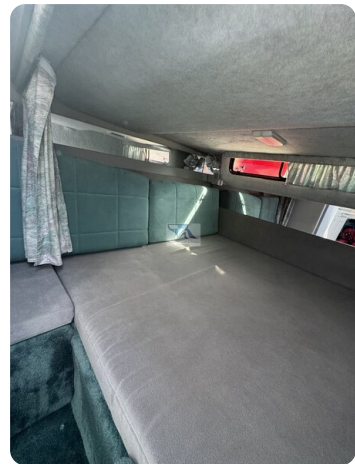
Formula BALU 58