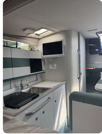
Formula BALU 60