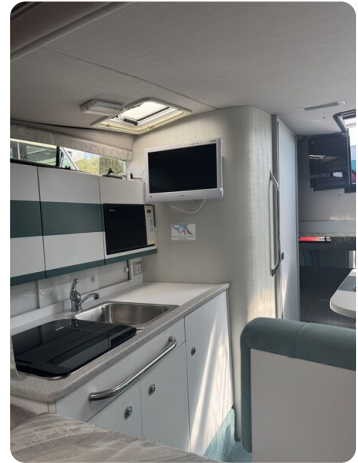
Formula BALU 60