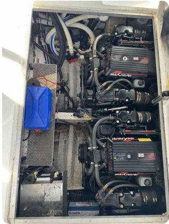
Formula BALU 21