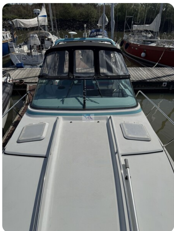
Formula BALU 5