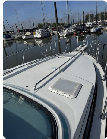
Formula BALU 78