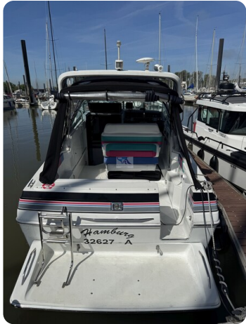
Formula BALU 36