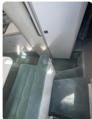
Formula BALU 71