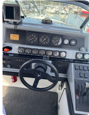
Formula BALU 23