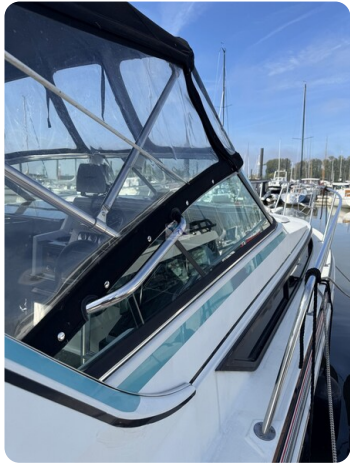
Formula BALU 79