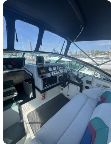
Formula BALU 27