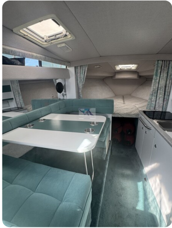
Formula BALU 70