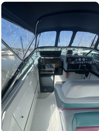
Formula BALU 28