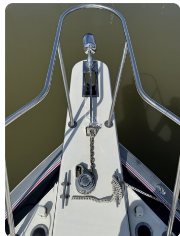
Formula BALU 8