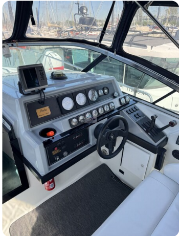
Formula BALU 22