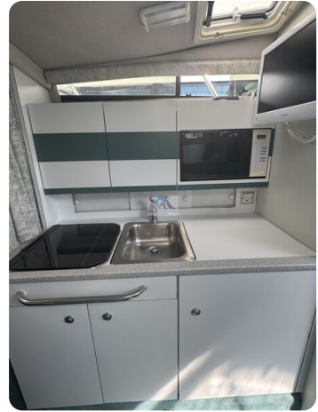
Formula BALU 66