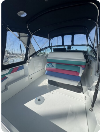
Formula BALU 31