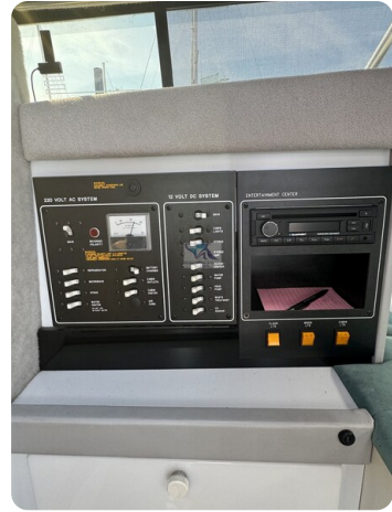
Formula BALU 52