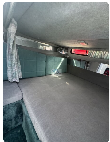
Formula BALU 58