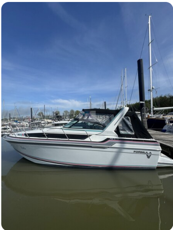
Formula BALU 74