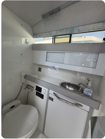
Formula BALU 48