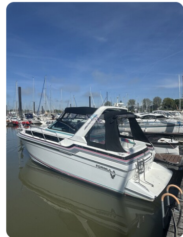
Formula BALU 33