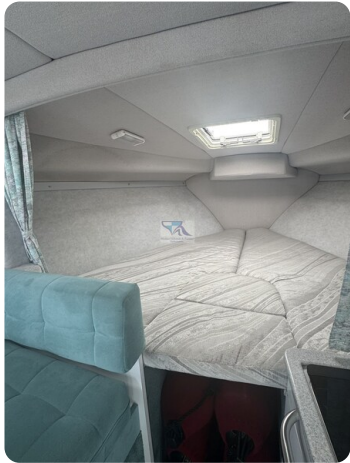
Formula BALU 68