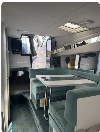
Formula BALU 61