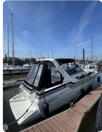
Formula BALU 1