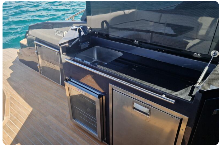
Focus Power 44