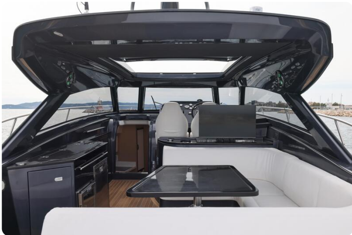
Focus Power 44