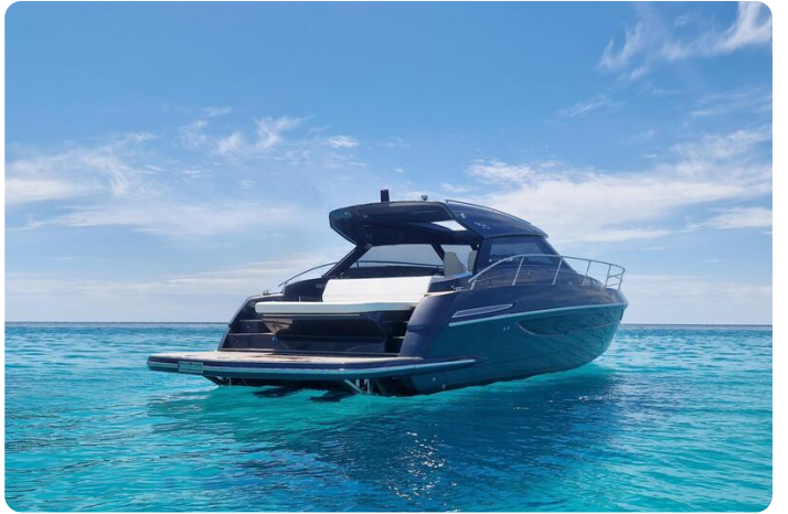
Focus Power 44