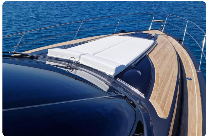
Focus Power 44