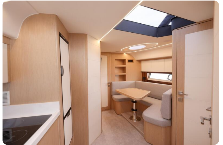
Focus Power 44