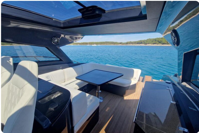
Focus Power 44