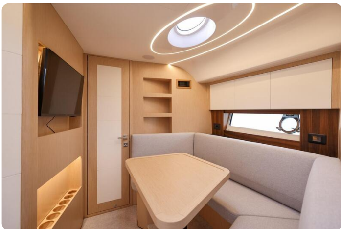
Focus Power 44