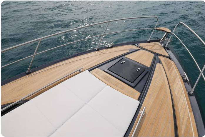
Focus Power 44