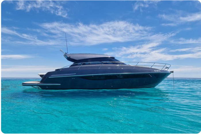
Focus Power 44