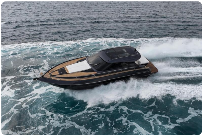
Focus Power 44