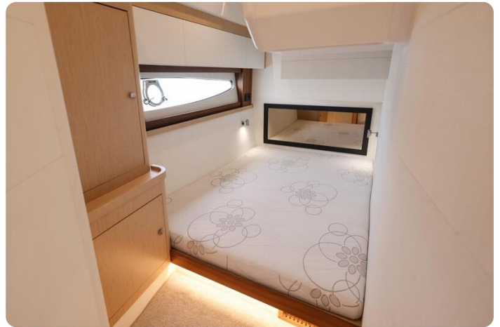
Focus Power 44