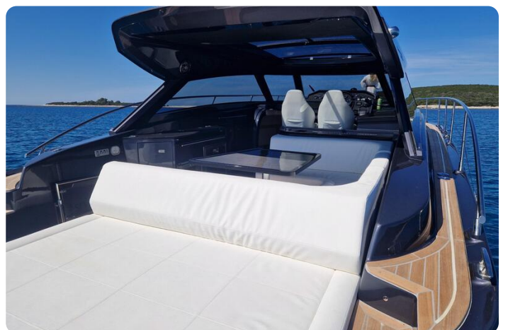
Focus Power 44