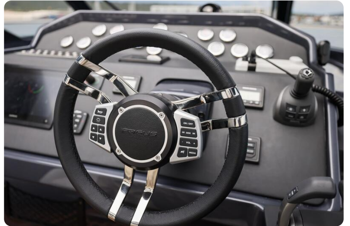
Focus Power 44