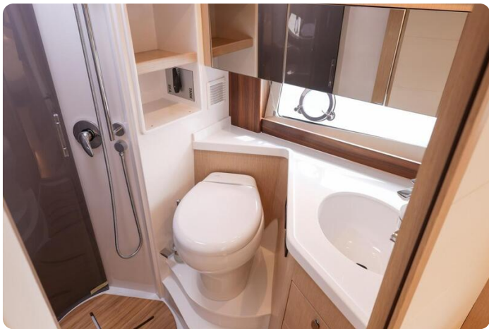
Focus Power 44