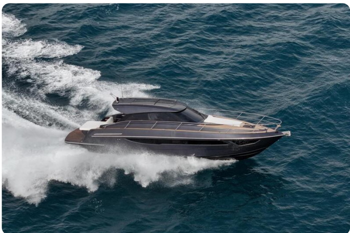
Focus Power 44