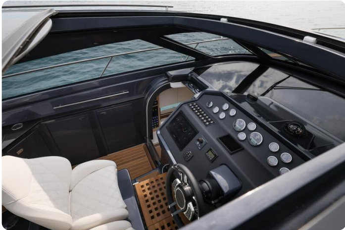
Focus Power 44