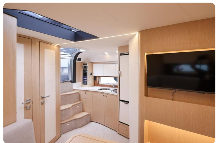
Focus Power 44