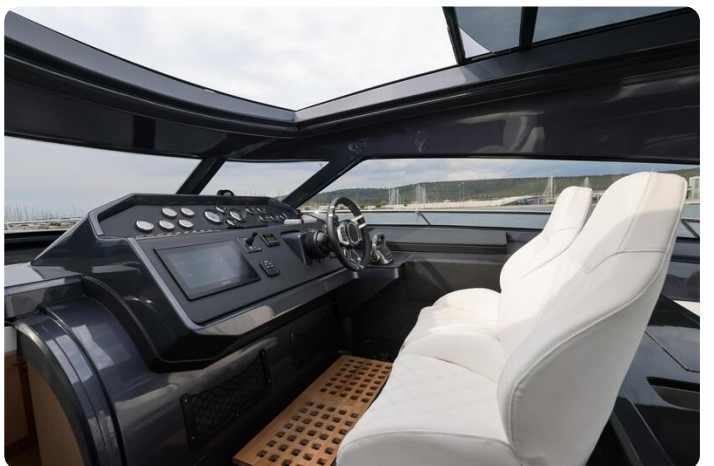
Focus Power 44