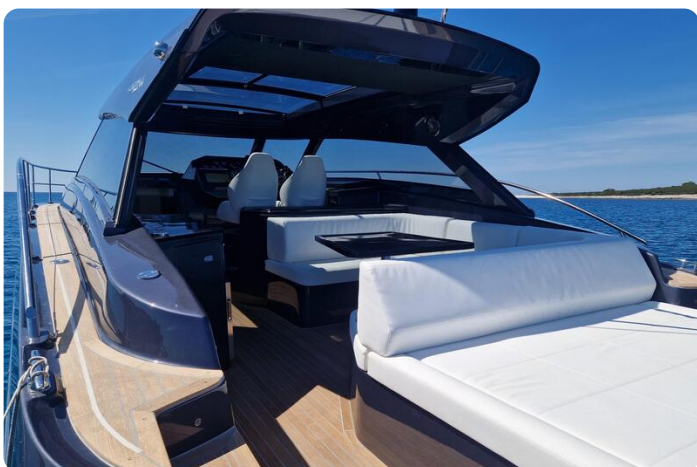
Focus Power 44