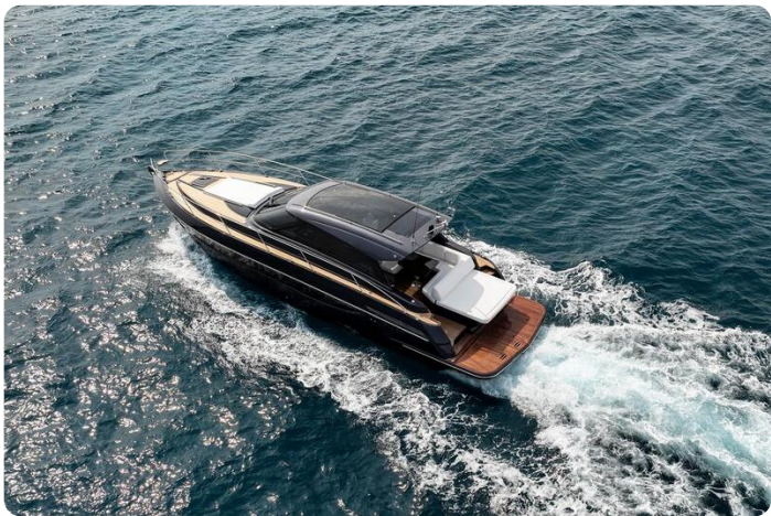
Focus Power 44