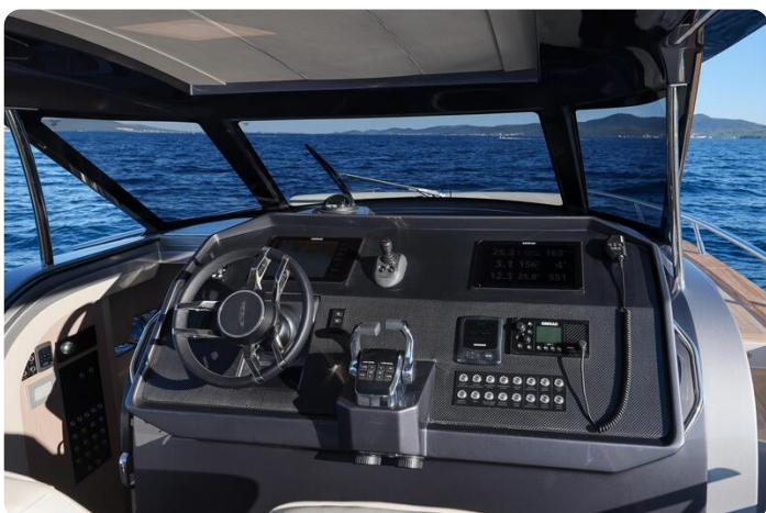
Focus Forza 37