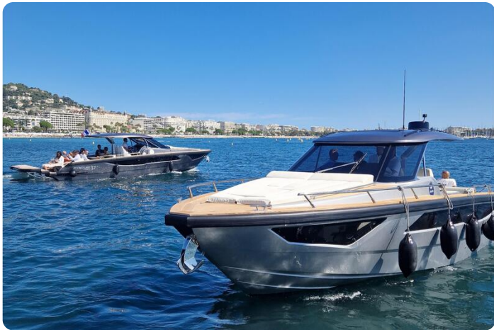
Focus Forza 37