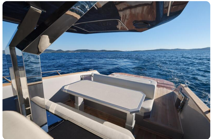
Focus Forza 37