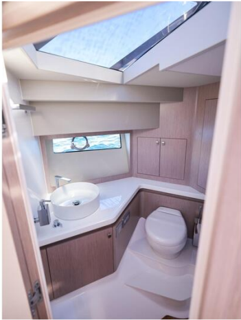
Focus Forza 37