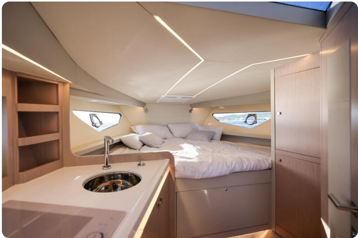
Focus Forza 37