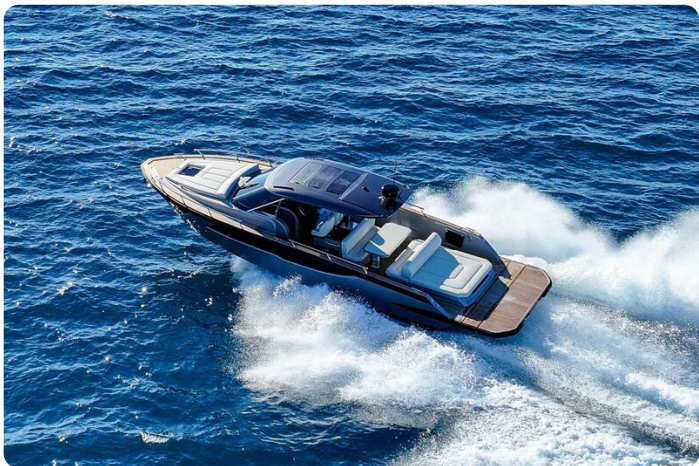
Focus Forza 37