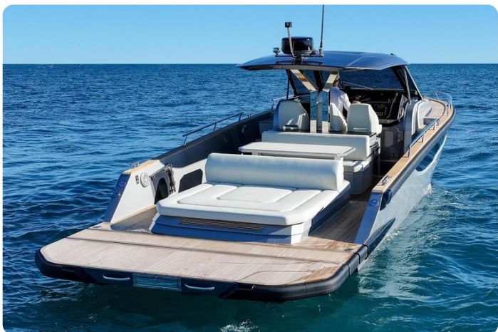
Focus Forza 37