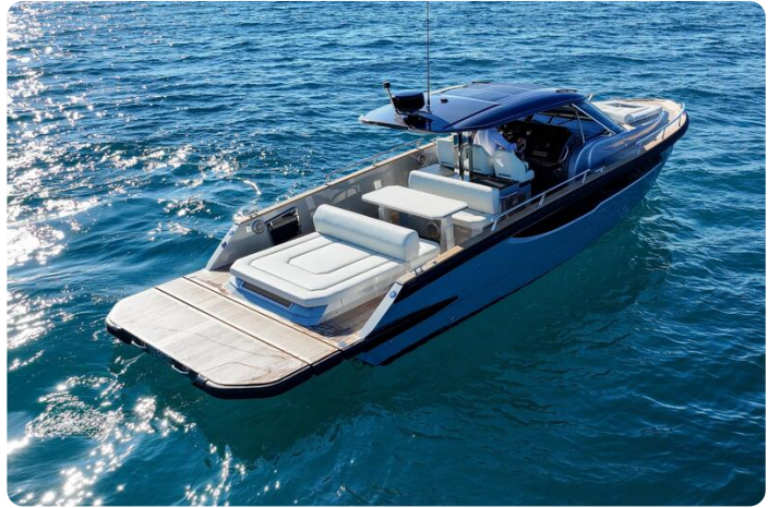
Focus Forza 37