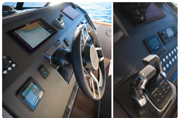
Focus Forza 37