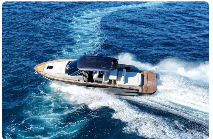
Focus Forza 37