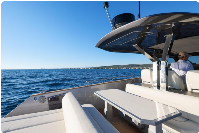
Focus Forza 37