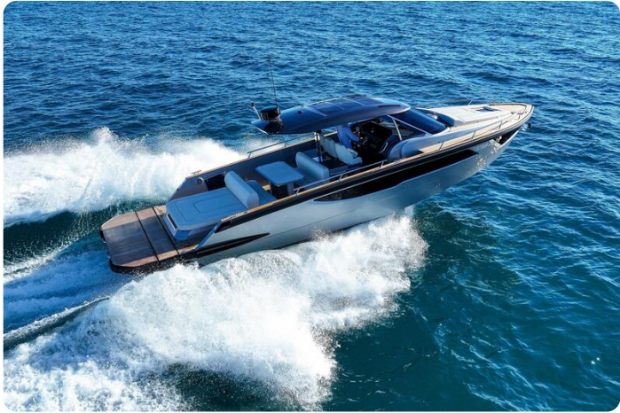
Focus Forza 37