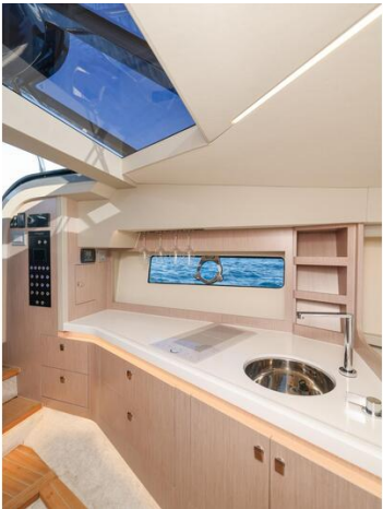
Focus Forza 37