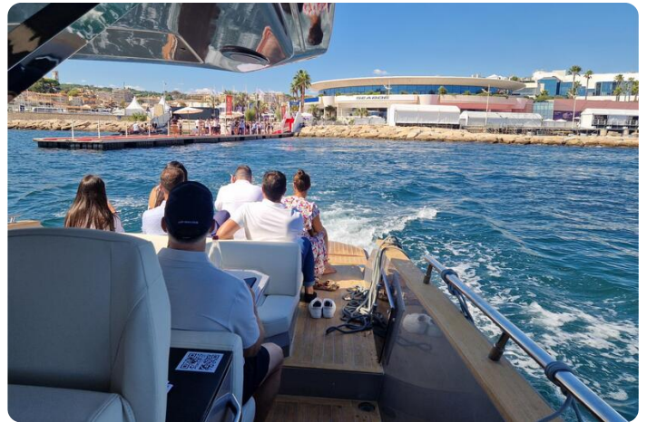
Focus Forza 37