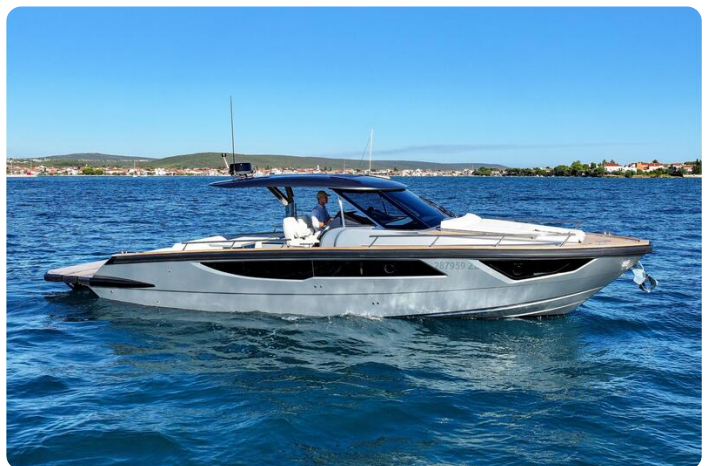
Focus Forza 37